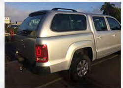
Spartan Fibreglass Canopies